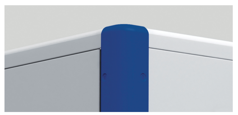
Robust corner posts provide excellent protection against damage during handling and transportation. Manufactured from a high-grade composite that is UV stable and weather resistant, they also offer optimum corrosion resistance while enhancing the overall design.