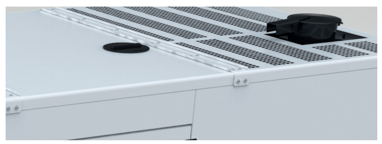
All roof joints are reinforced with lap joints utilising butyl rubber seals, providing excellent protection against water ingress in extreme conditions. Curved edges ensure a rigid and aesthetically pleasing enclosure structure. The radiator is accessed via a flush mounted rain cap with compression seal – a further guard against water ingress.

Innovative, functional design enhancements have been made to the enclosures available on this range. The robust and aesthetically pleasing enclosure includes many ingenious new features, delivering an enclosed generator set that is designed to perform in the harshest of environments.