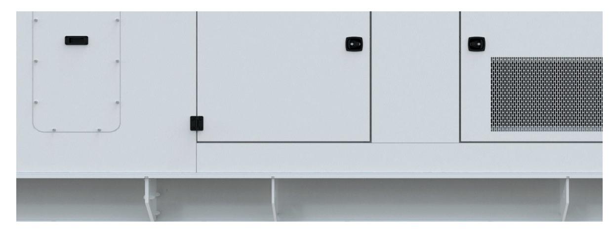
Side hinged doors on each side of the enclosure and removable ducts provide easy access to conduct minor services or major overhauls without the need to remove the enclosure. Control panels and breakers can be easily accessed through the rear door.