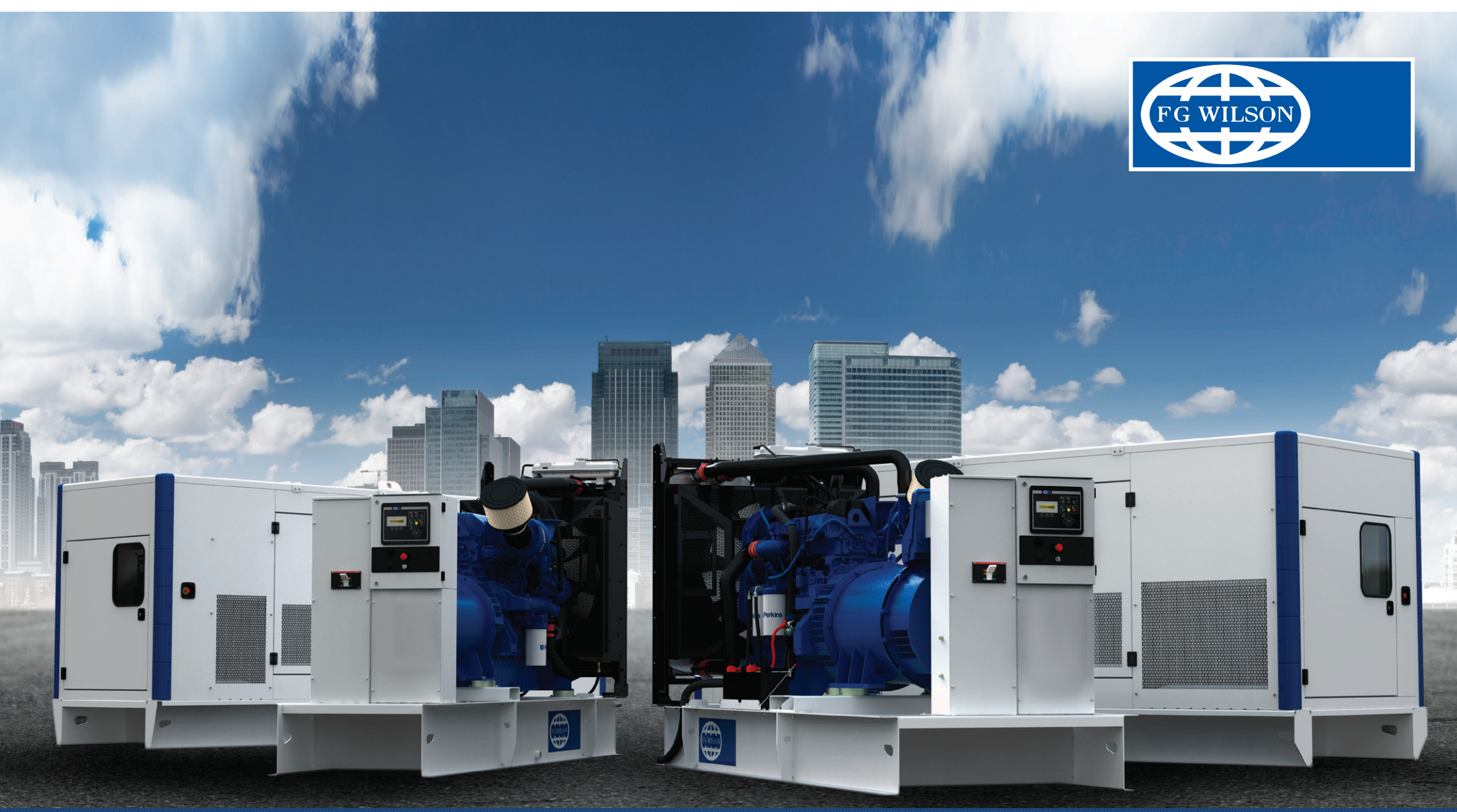
Expert Design...Trusted Power