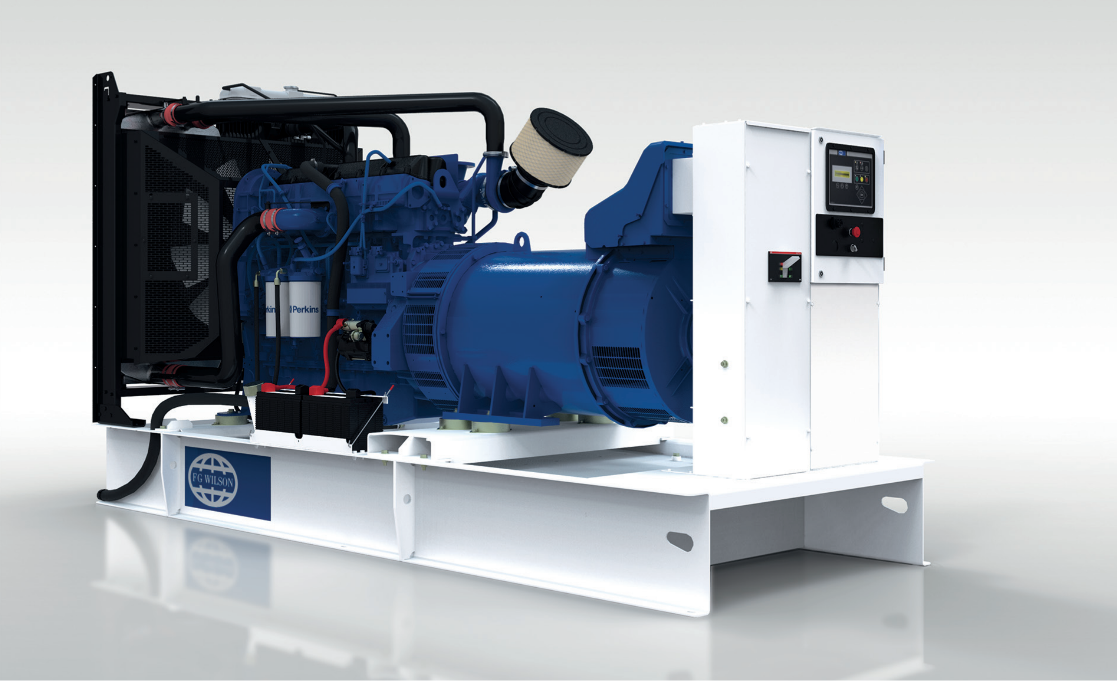
The robust and compact base frame extends beyond all mounted generator set components for added protection. It is constructed with high-grade, heavy-duty steel and protected by powder coat paint, ensuring maximum corrosion resistance and durability – a truly solid foundation for this high performance range of generator sets.